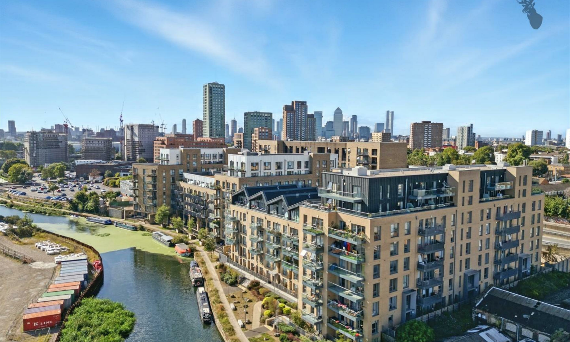
Nicholson Square, London, E3